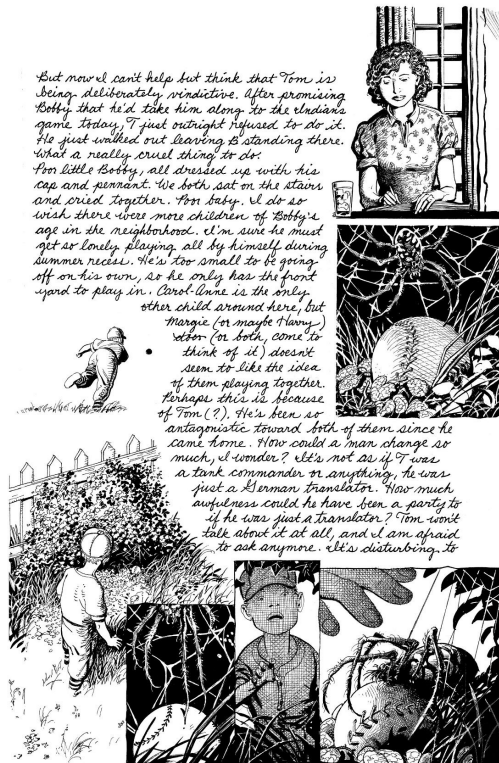
Monsters, page 155.

There are many pages in Monsters with unusual text density for present day comics. Mainstream comics sometimes had this much text up to the 1970s – unnecessary copy, descriptions of things you could see for yourself in the drawings – but maybe not with these speech balloon masses: