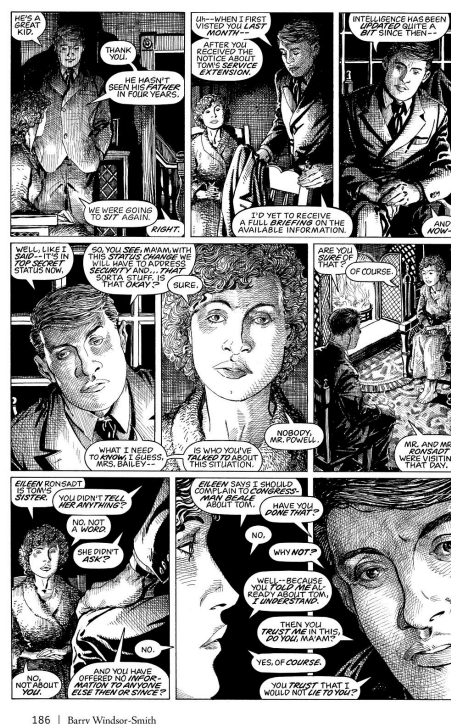
Monsters, page 186.

It's about the colloquial aspect, or mumbling, some critics have commented upon (see last entry). There are many superfluous enunciations, from an informative or plot standpoint, but they contribute to the "talkiness" aspect that BWS seems to aim for. A lot of "uh" ("hã" in Portuguese), many unfinished phrases, a convoluted way of getting to the point. It's a stylistic choice the translation should aim to convey.