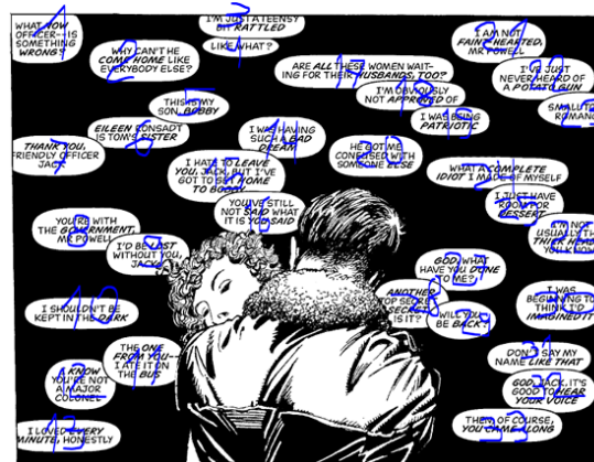
Monsters, detail from page 262 with my markings.

Except when he does not. Well, when he purposefully does not.