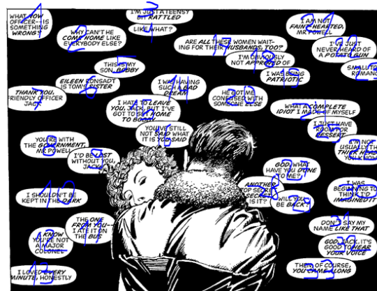
Monsters, detail from page 262 with my markings.

Of interest for this second draft is the revised version of page 262, which I talked about on the May 13 entry. Now, besides the numbered speech balloons, I added references to the pages where each line is previously said, so that I, the proof-reader, editor, and other people who will work on the book can coordinate in case they need to alter the text.