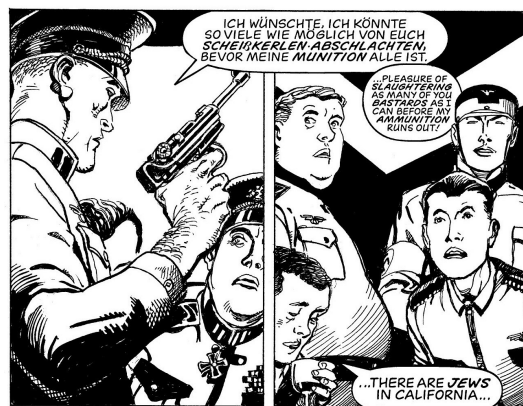
Monsters, page 303.

Actually, there's one thing I kept thinking while translating today's pages, which is not exactly my problem. The scene is set in Germany, at the very end of World War II, and some dialogue is written in German. Some of it is not translated, but some of it is translated right below, in another speech balloon. There's a story-wise explanation for this: one of the point-of-view characters is a G.I. interpreter, so it's like we are hearing him translate it. A small sample: