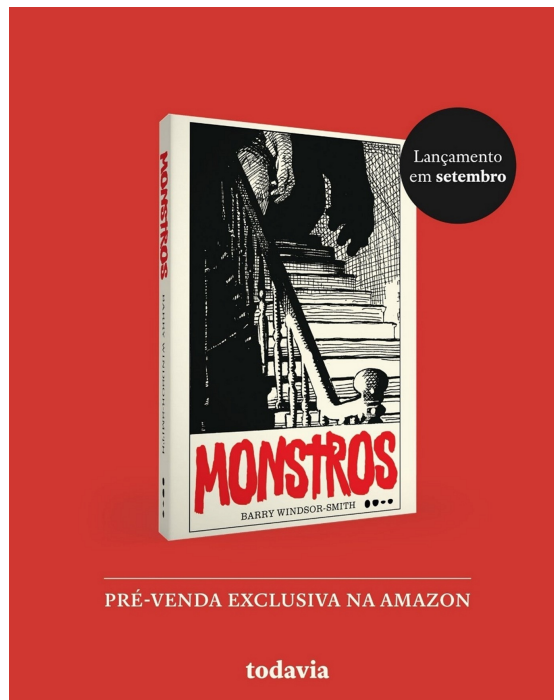
Online ad for Monstros by publisher Todavia.

– Todavia, Monsters ' Brazilian publisher, set up a great online marketing campaign for the book's preorders. Posts like this one and this one on their Instagram account delve into the origins of the book and its author. Todavia also sponsored famous YouTube and Instagram comics channels to create videos on Monsters and on BWS' career. The graphic novel is deemed expensive for Brazilian standards: its cover price is R$ 149,90, roughly 28 € or US$ 29. As the real is currently devalued, though, it's the cheapest Monsters edition in the world. The American one and the German one cost US$ 40 and 40 €, respectively. Some Brazilian readers are complaining about the exclusive Brazilian cover, with a different illustration, and Todavia's option for a softcover edition. According to the publisher, half the print run is already sold to bookstores.