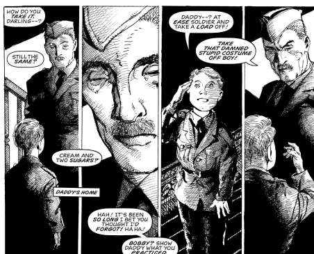
Monsters , detail from page 135.

It's not easy to translate "hillbilliese". Not only because I shouldn't use a typical "Brazilian hillbilliese", but also because they love to use "damned" or "goddamn" and we don't use the same structure for swearing in Brazilian Portuguese. There's another layer of word-wrangling to make sure these imprecations sound like equivalent cursing.