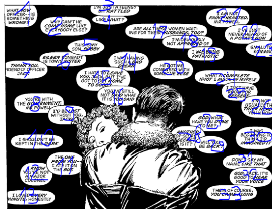
Monsters, detail from page 262 with my markings.

Of interest for this second draft is the revised version of page 262, which I talked about on the May 13 entry. Now, besides the numbered speech balloons, I added references to the pages where each line is previously said, so that I, the proof-reader, editor, and other people who will work on the book can coordinate in case they need to alter the text.