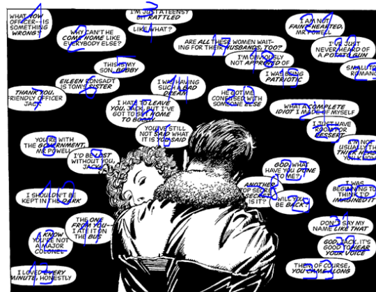
Monsters, detail from page 262 with my markings.

Except when he does not. Well, when he purposefully does not.