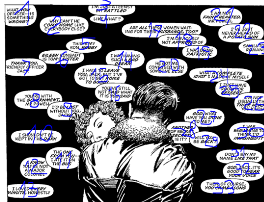
Monsters, detail from page 262 with my markings.

Of interest for this second draft is the revised version of page 262, which I talked about on the May 13 entry. Now, besides the numbered speech balloons, I added references to the pages where each line is previously said, so that I, the proof-reader, editor, and other people who will work on the book can coordinate in case they need to alter the text.