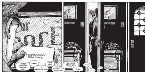
Monstros, detail from page 59.