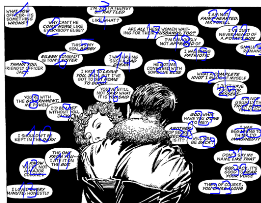
Monsters, detail from page 262 with my markings.

Except when he does not. Well, when he purposefully does not.