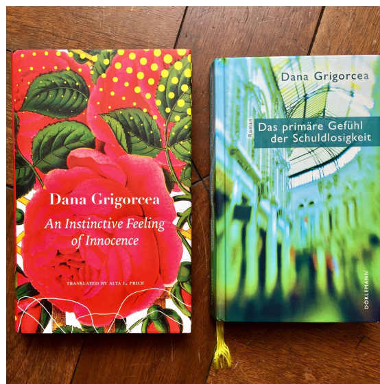
Dana Grigorcea »Das primäre Gefühl der Schuldlosigkeit«