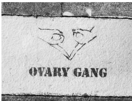
Anonymous member from Team 2

For the question of legitimacy in translation divides the translation world into two teams : one side thinks that not any translator can translate just anything, and the other thinks the opposite.